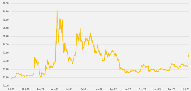
Figure 2: XRP 1-Year Implied Daily Volatility